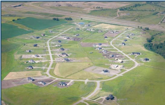
Aldersyde Community, Aldersyde, AB Reclaimed to Country Residential properties