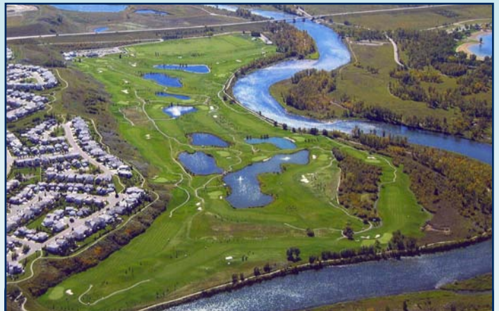
Golf Course, Calgary, AB Reclaimed to Golf Course property

As a responsible corporate citizen, Inland Aggregates has reclaimed former pit operations to scenic parks, golf courses, athletic parks, residential communities and farmland.