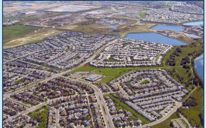
Riverbend Community, Calgary, AB Reclaimed to City Residential properties

With many community investments, Inland Aggregates is working to fulfill the corporate vision of “Working Together To Build Our Communities” .