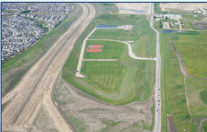
Inland Athletic Park, Calgary, AB Reclaimed to Outdoor Recreation facility