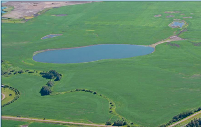
Villeneuve Operation, Sturgeon County, AB Reclaimed to former use as cropland